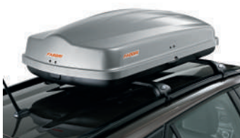
ROOF BARS AND ROOF BOXES