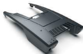
SPECIAL COMPONENTS FOR THE AUTOMOTIVE