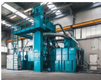
SANDBLASTING OF METALS