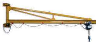
COLUMN-MOUNTED JIB CRANES WITH ARM