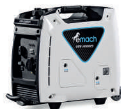
SOUNDPROOF INVERTER GENERATORS