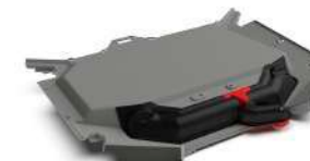
VEHICLE LININGS AND BODIES