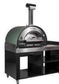
ARDE. WOOD-FIRED OVENS WITH DIRECT FIRE