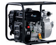
SELF-PRIMING MOTOR PUMPS