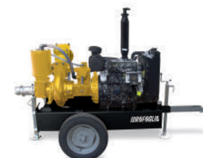
DRY PRIME SERIES MOTORPUMP