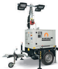
LIGHTING TOWERS WITH ENGINE