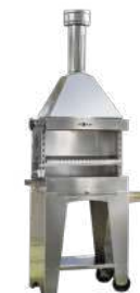
FOXY. CHARCOAL GRILL