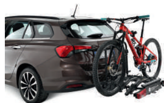
TOWBAR, TAILGATE AND ROOF BIKE CARRIERS