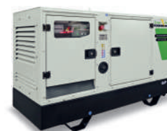
SOUNDPROOF GENERATING SETS