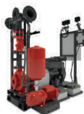
EN12845 FIRE FIGHTING UNITS