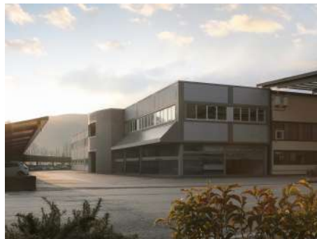
EPTA POLO 2 SASSOCORVARO (PU) ITALY