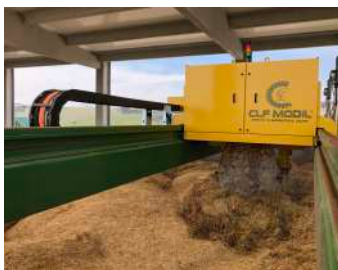
CLF MODIL - WASTE DISTRIBUTION SYSTEM