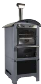
LUCE. WOOD-FIRED OVENS WITH INDIRECT FIRE