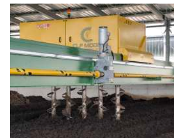
CLF MODIL - MIXING OF THE SOIL IMPROVER AFTER COMPLETION