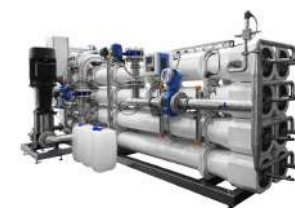
WATER TREATMENT PLANTS. REVERSE OSMOSIS