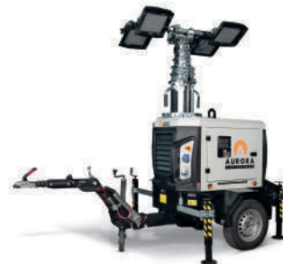
LIGHTING TOWERS WITH ENGINE, BATTERY OR HYBRID