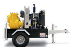
WELL POINT SERIES MOTORPUMP