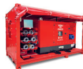
ISO CERTIFIED MODULES