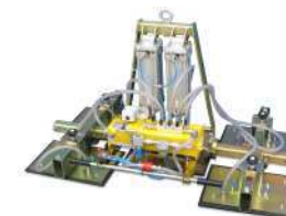
BRIDGE CRANE, VACUUM LIFTERS, SPREADER BEAMS AND PLIERS