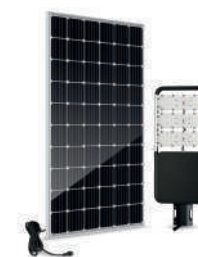
FLOOD LAMPS AND STREET LIGHTING SOLUTIONS