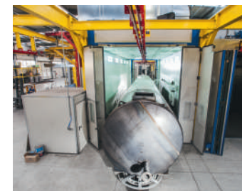
LIQUID PAINTING OF METALS