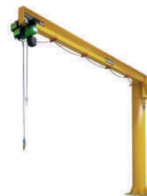
COLUMN-MOUNTED JIB CRANES WITH CANTILEVER ARM