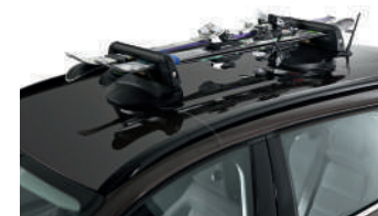
SKI RACKS AND CAR ACCESSORIES