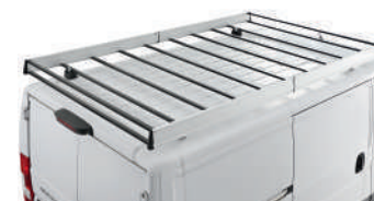
EQUIPMENT FOR COMMERCIAL VEHICLES