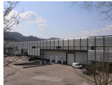
EPTA POLO 3 PIANDIMELETO (PU) ITALY