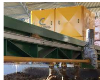
CLF MODIL - MIXING AND OXYGENATION