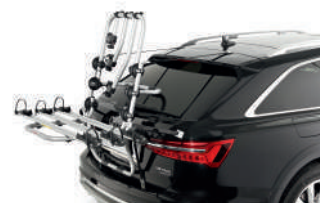
BIKE CARRIERS, SKI RACKS AND CAR ACCESSORIES