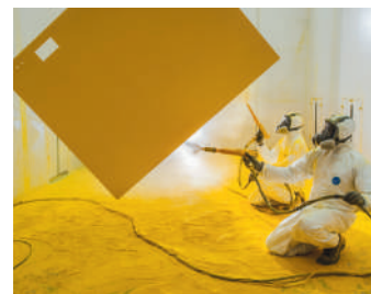
POWDER COATING OF METALS