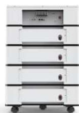
INVERTER AND SINGLE PHASE SOLUTIONS