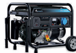
AVR CURRENT GENERATORS