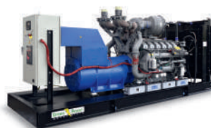
OPEN GENERATING SETS