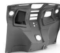
DASHBOARDS FOR INDUSTRIAL VEHICLES