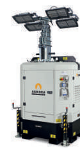
LIGHTING TOWERS WITH BATTERY AND ENGINE