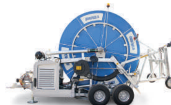
IRRIGATION MACHINES WITH INCORPORATED MOTORPUMP