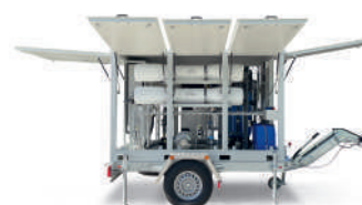
WATER TREATMENT PLANTS MOBILE UNITY