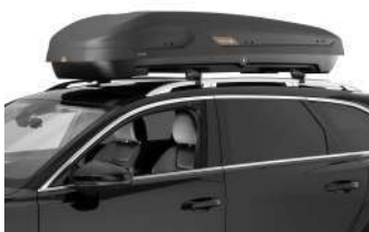
ROOF BARS AND ROOF BOXES