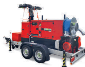
ALLIGATOR SYSTEM ON ROAD TRAILER