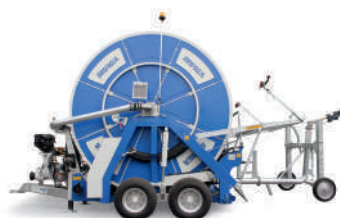
IRRIGATION MACHINES WITH TURNTABLE