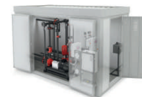
UNI11292 MODULES FIRE FIGHTING UNITS