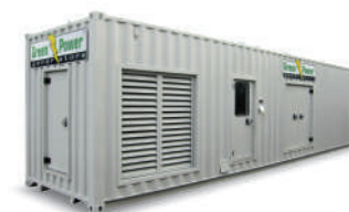
CONTAINER GENERATING SETS