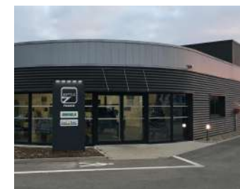
SHOWROOM AND SERVICE CENTRE