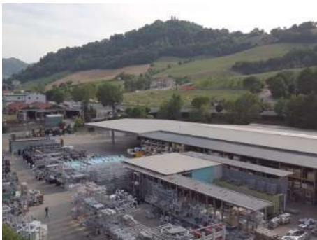
EPTA POLO 1 LUNANO (PU) ITALY