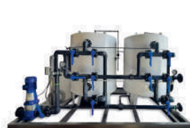
WATER TREATMENT PLANTS. FILTRATION