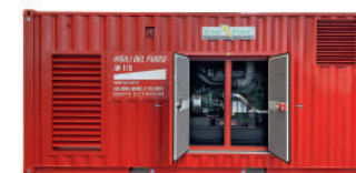
CONTAINER GENERATING SETS