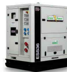
INTEGRATED ENERGY STORAGE SYSTEMS