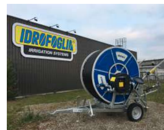
SHOWROOM AND SERVICE CENTRE