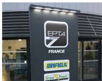
SHOWROOM AND SERVICE CENTRE