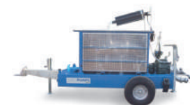
STANDARD AND SOUNDPROOF MOTORPUMPS